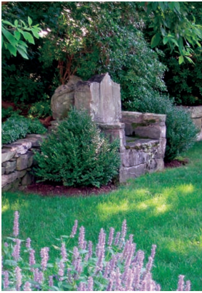
Built of natural stone, this garden seat is surprisingly comfortable. Lavender, famed for its calming scent, is planted within wafting distance.