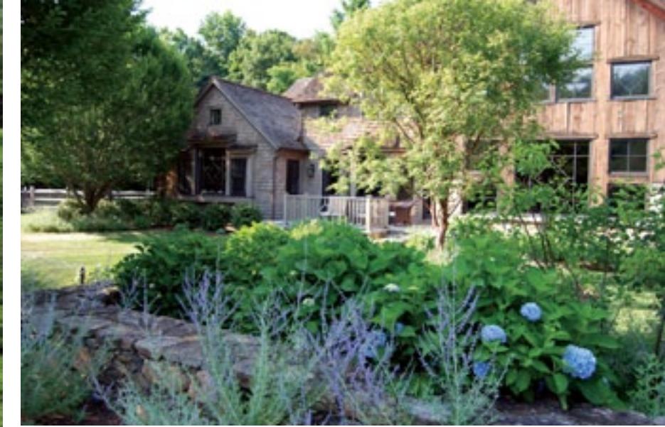
Low stone walls provide definition and places to sit amid new plantings, including nepeta, lady's mantle, sedum.