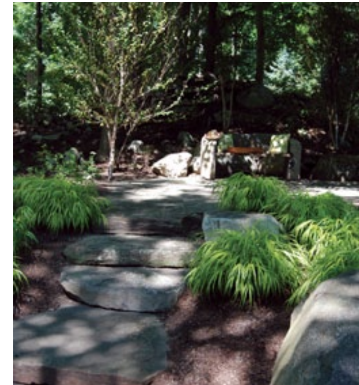
Big rocks were found during excavation, salvaged and placed by paths, including near the meditation garden.