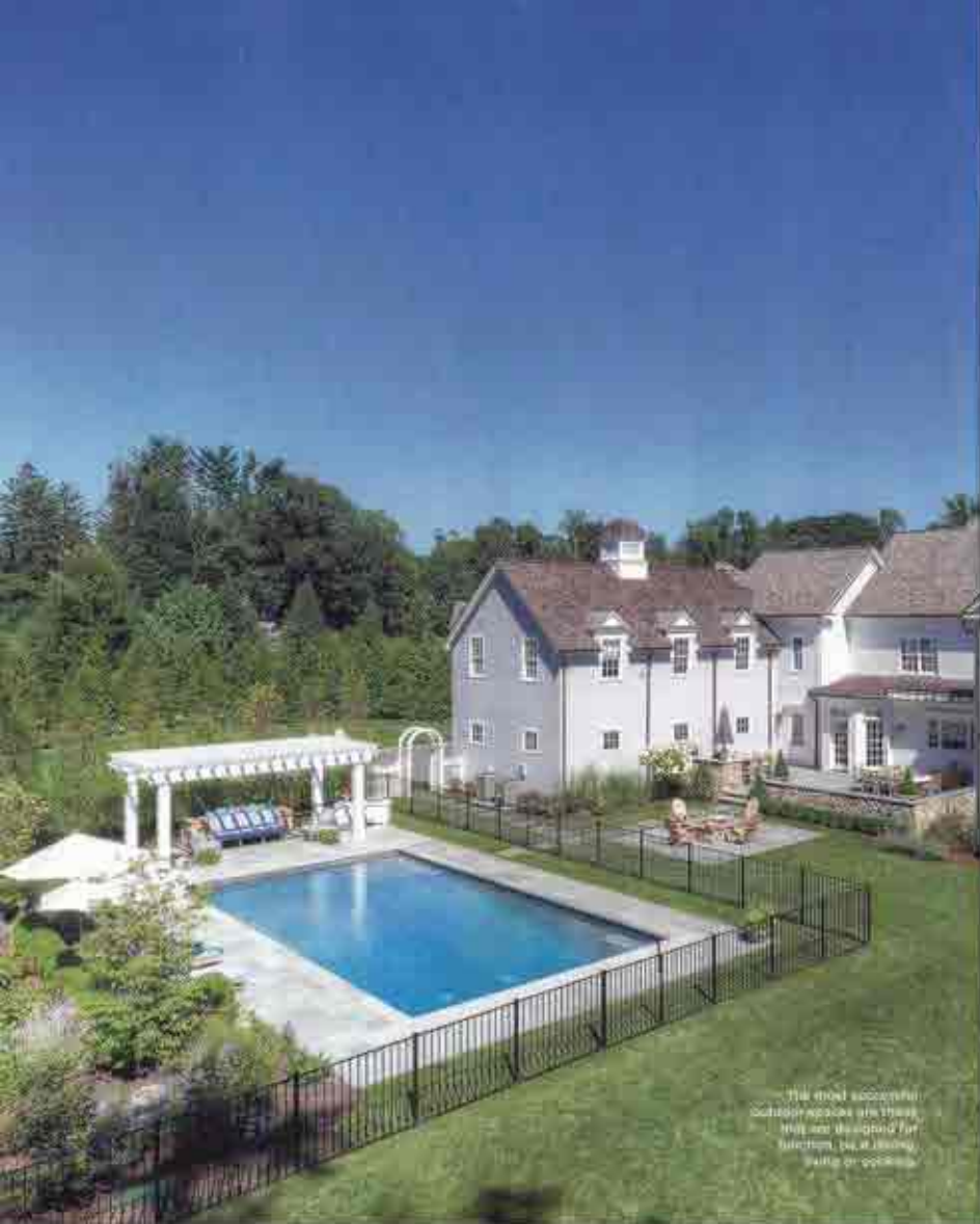
The most successful outdoor spaces are those that are designed for function, like a dining table or barbecue.